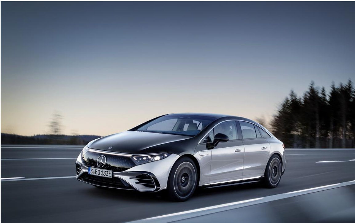
And then the new EQS, the first all-electric luxury saloon from Mercedes-with EQ (intelligent electric). See our next newsletter in early October for more about the EQ models.