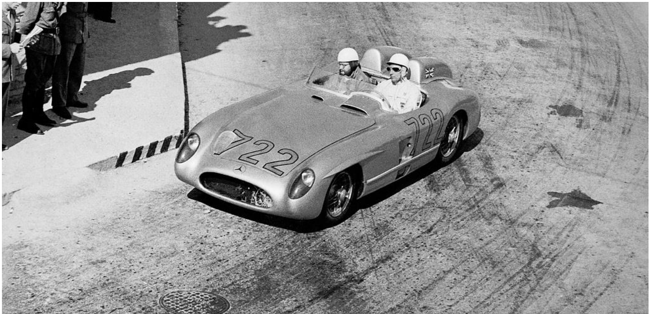
Mille Miglia (Brescia/Italy), 1 May 1955. The eventual winners Stirling Moss/Denis Jenkinson on the track in the Mercedes-Benz racing sports car 300 SLR (W 196 S) with start number 722.