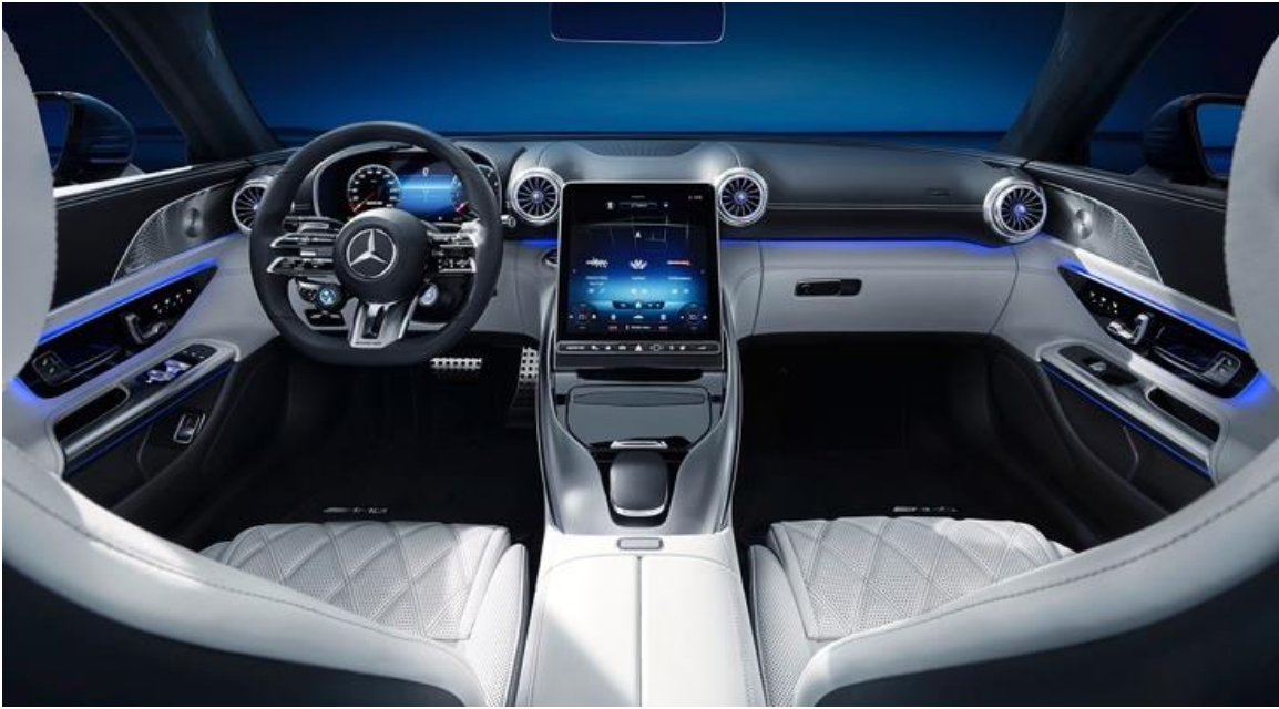
From the recent articles in the Star about the R107, here is the interior of the next generation in the AMG SL. Note the new design of the central display – a feature appearing in the new Mercedes–Benz models.