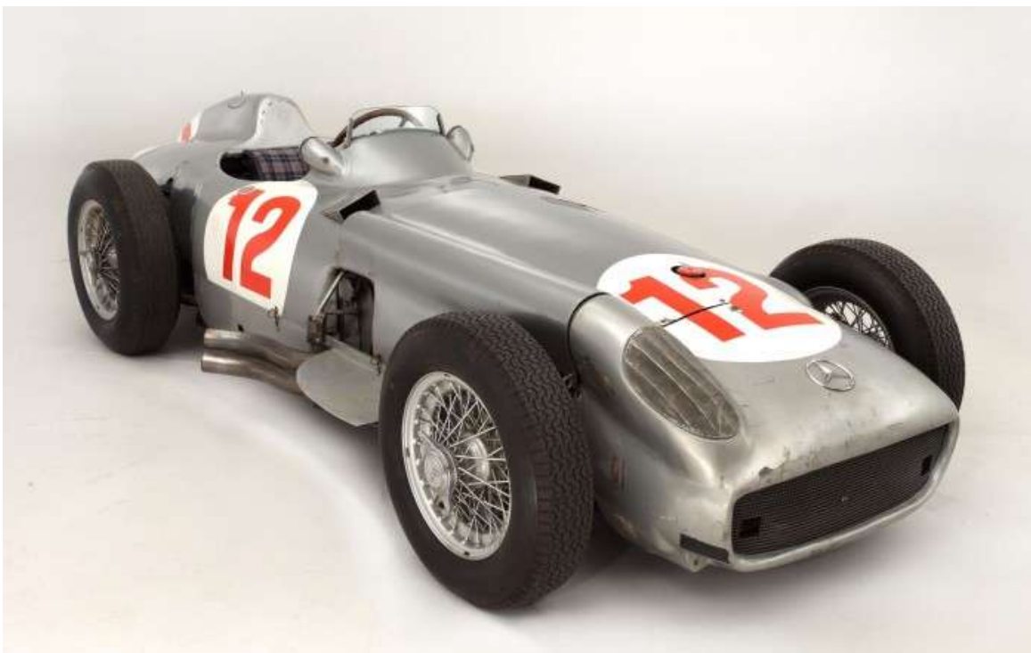
Nice to see the less than perfect condition.

Even without the direct link to Fangio, calling the car historically significant is a bit of an understatement. Following Fangio's time behind the wheel, the car was driven by Hans Hermann and later by Karl Kling. On its retirement from racing, it was restored and displayed in the Mercedes-Benz museum and later shown throughout Europe, before being pressed into service for tire development and testing. It was also the favorite testing car of the legendary Mercedes-Benz engineer, Rudolf Uhlenhaut, who in late 1969 had it reserved at all times for his personal use. (content from hemmings.com)