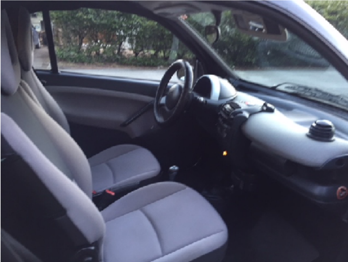
Leo's completed Smart looks like new inside!