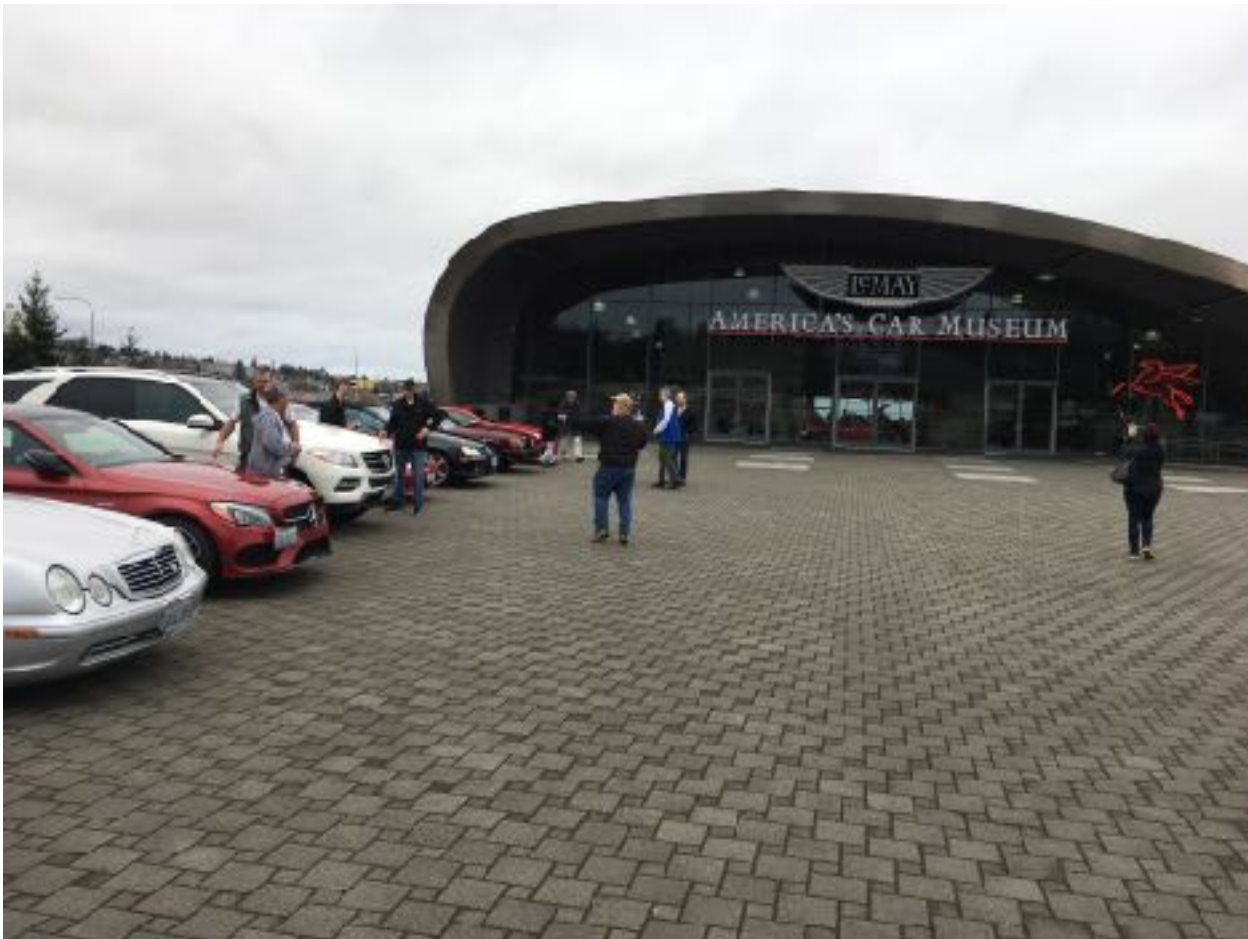
The club display forecourt at the LeMay Museum

The LeMay Museum is just a few blocks off I5 in South Tacoma with quick access from the highway. If you've not been already, Donelda and I recommend a half-day stop there when you can find the time. We're looking forward to returning for a more leisurely wander through, when, we understand, some of the cars displayed will likely be different.